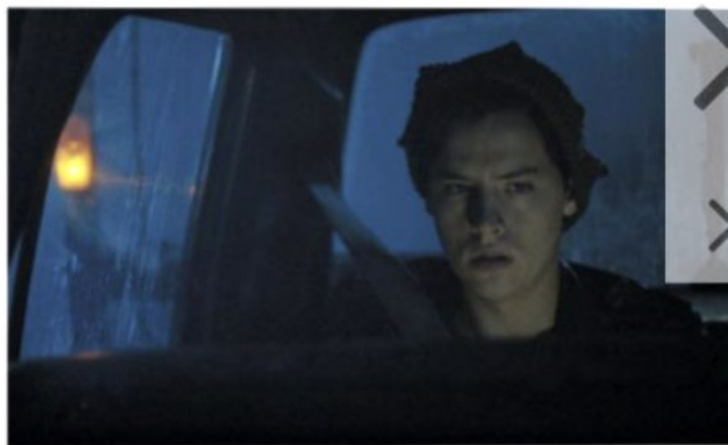
Top: In the episode "The Watcher in the Woods," Betty helps Jughead set up the office for The Red and Black , the school paper at Southside High. Above: In "Tales From the Darkside," Jughead finds himself in a stressful situation while trying to make a delivery to the neighboring town of Greendale.

After Archie escapes from the coffin, he chases the Black Hood out onto an old wooden bridge, where the